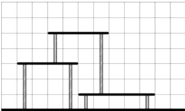
The total length of the columns is 14.